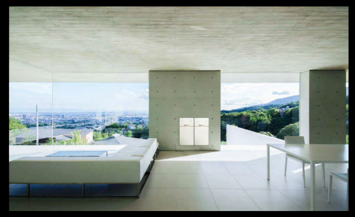
Suitable for indoor or outdoor installation