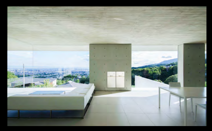
Suitable for indoor or outdoor installation